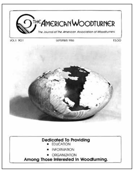
In 1986, the first cover of American Woodturner challenged everything that had gone before in woodturning. The challenge continues...

So these two groups, the traditionalists and the innovators, found common ground in technique and that has defined their relationship ever since. Increasingly, however, the Internet (and particularly YouTube) has allowed newcomers to bypass this relationship. In their rush toward "fame," many hopeful turners are not aware of the time it takes to attain the level of skill their heroes attained. A web search using the word woodturning will reveal